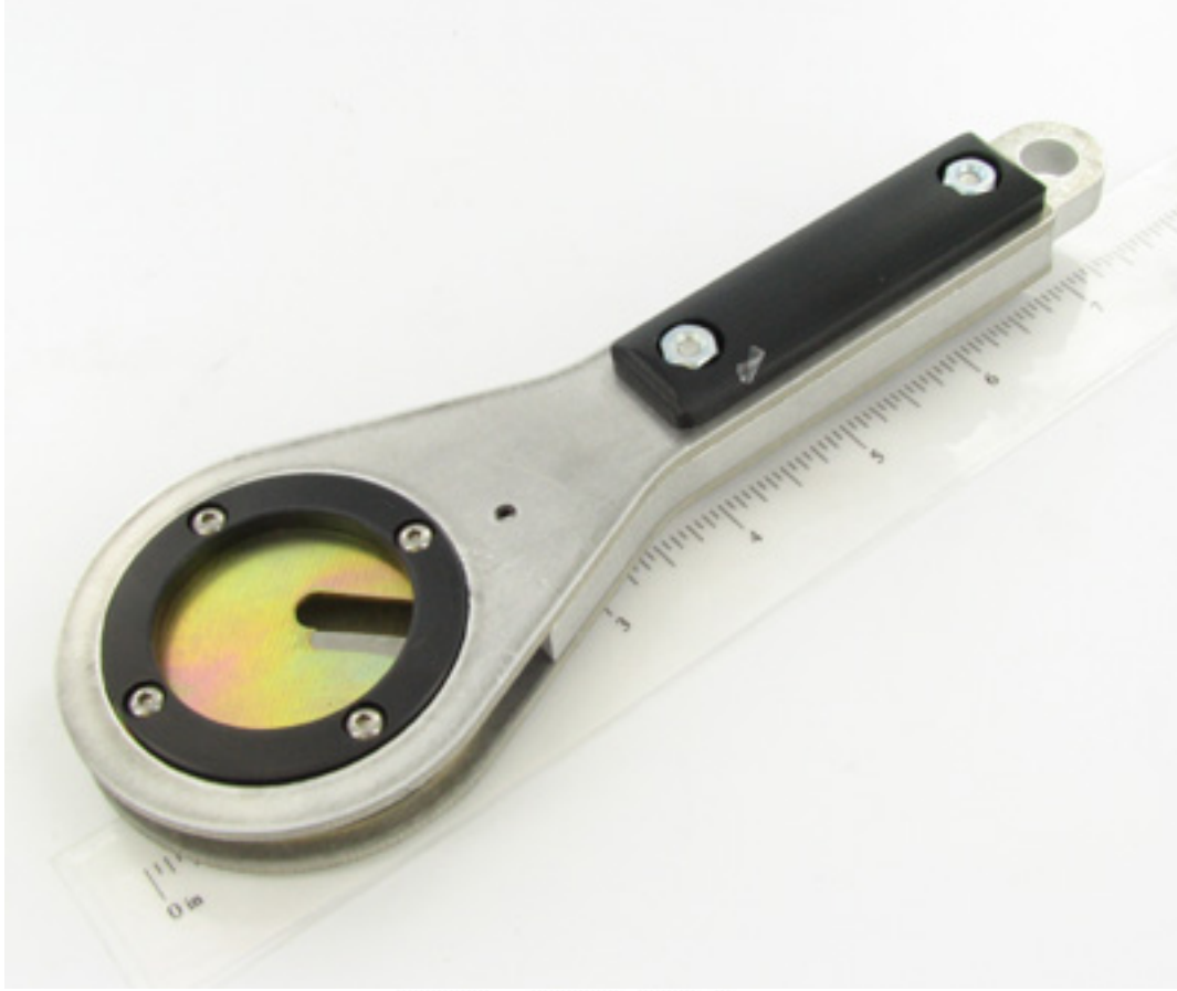
Mnmc ratchet for assy

Part Number: CTS15014 MiniMc Ratchet Facer Assembly